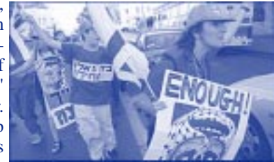
The recent rash of suicide bombings during an Israeli ceasefire that have left dozens of Israelis dead has caused citizens to say enough. It is time to wage war on Arafat and the Palestinian leadership.

Just as DTT predicted in July 2000, the Camp David Peace Summit has led to a condition of war in which the international community is systematically moving ever closer to intervening and force a peace covenant on Israel – just as the Bible says would happen. If Israel goes after Arafat and the terrorist leadership, the Arab nations will have to respond. Likewise, if the Hizballah launch a rocket attack into Israel, Israel will likely retaliate by massive attacks