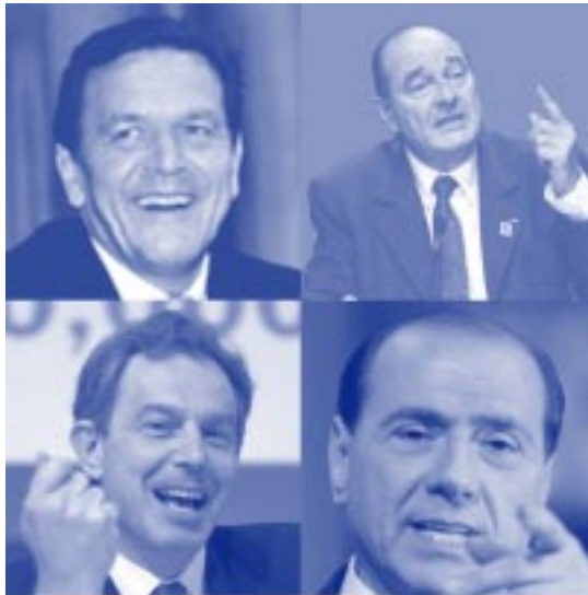
The principle power players in Europe. Top: Gerhard Schröder, Chancellor of Germany and Jacques Chirac, President of France. Both are fighting hard for a European superstate, but are at odds over which model of governance to use. Bottom: Tony Blair, Prime Minister of England and Silvio Berlusconi, Premier of Italy are both strongly opposed to the European superstate.

Berlusconi's election is the most severe threat to the EU superstate ever faced, and EU proponents are trying to find ways to discredit