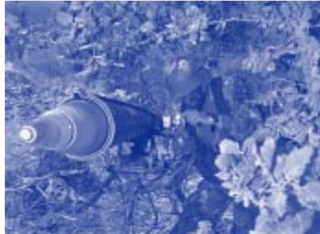
A Katyusha rocket in its launcher in Southern Lebanon ready to launch at an Israeli target on May 22.

Just before the suicide bombing, Israeli Defense Force spotters watched Hizballah guerrillas, led by Hizballah leader Sheikh Hassan Nasrallah, "openly and with much bravado rigging Katyusha rocket launchers in Southern Lebanon and bringing up quantities of rockets in trucks," reported DEBKAfile . The order to launch the rockets was awaiting Syrian president Bashar Assad's approval. Just when all this was going down Assad suddenly aborted a