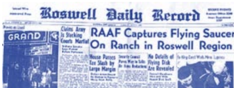
The July 8, 1947 frontpage headlines of the Roswell Daily Record .

On May 9, 2001, UFO excitement was reignited as "20 witnesses from the American military, intelligence services, and scientific establishments gave their testimony to start a campaign which they hope will force the government to investigate the UFO phenomenon," according to an Independent News article. In-