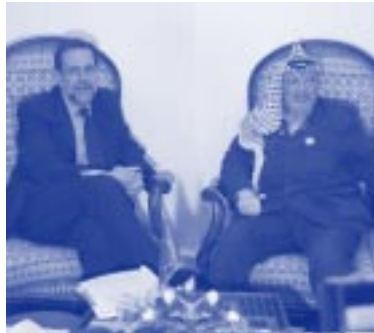
European Union Foreign Policy and Security Chief meets with Yasser Arafat on May 21. Solana, architect of the Kosovo plan, has assumed the role of international peace negotiator.

(Continued from page 7) Immediately following the May 18-19 bombing by the IDF, Israeli Defense Minister Binyamin Ben-Eliezer had telephoned US Secretary of Defense Donald Rumsfeld to tell him Israel held Arafat "personally responsible" for the spate of recent suicide bombings. "Arafat is pushing and supporting terror of all groups, be they from the opposition or from the Palestinian Authority." Ben-Eliezer justified Israel's harsh retaliation by saying, "Israel was defending the security of its residents and strengthening regional stability, since Arafat was threatening this vital interest."