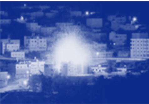
An Israeli tank shell explodes in a building in Bethlehem in sustained fighting in the Hebron-Bethlehem area during the first week of April. Israel has launched a preemptive war against the Palestinians after learning of a Palestine-Syria-Iraq alliance to drive the Jews out of Israel.

make a comparison to today's alleged repression of Israel of the Palestinians to Hitler's holocaust during World War II. The extremely inflammatory words could have been spoken by Assad's father 20