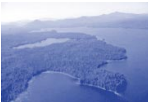
The Pingree ownership has 110 lakes and over 215 miles of lakeshore frontage.

In 1992 the Environmental Grantmakers Association (EGA) met to discuss how they were going to accomplish their goal of controlling the natural resources of America and specifically how it was going to be done on private land in the North-